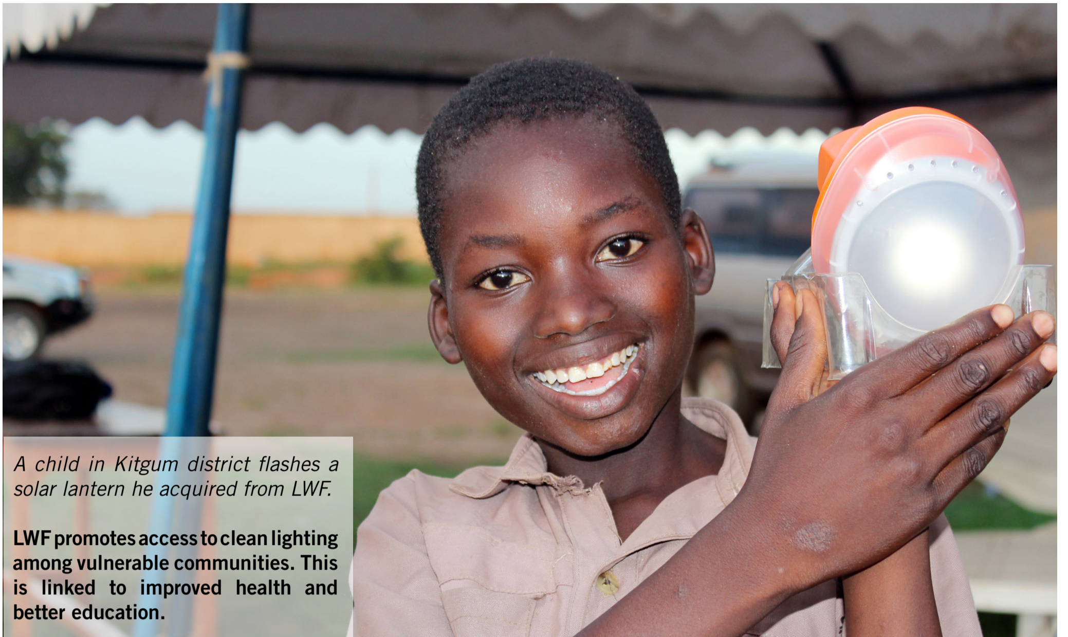
A child in Kitgum district flashes a solar lantern he acquired from LWF.

LWF promotes access to clean lighting among vulnerable communities. This is linked to improved health and better education.