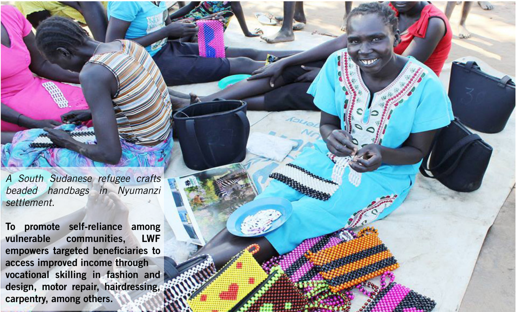
A South Sudanese refugee crafts beaded handbags in Nyumanzi settlement.

To promote self-reliance among vulnerable communities, LWF empowers targeted beneficiaries to access improved income through vocational skilling in fashion and design, motor repair, hairdressing, carpentry, among others.