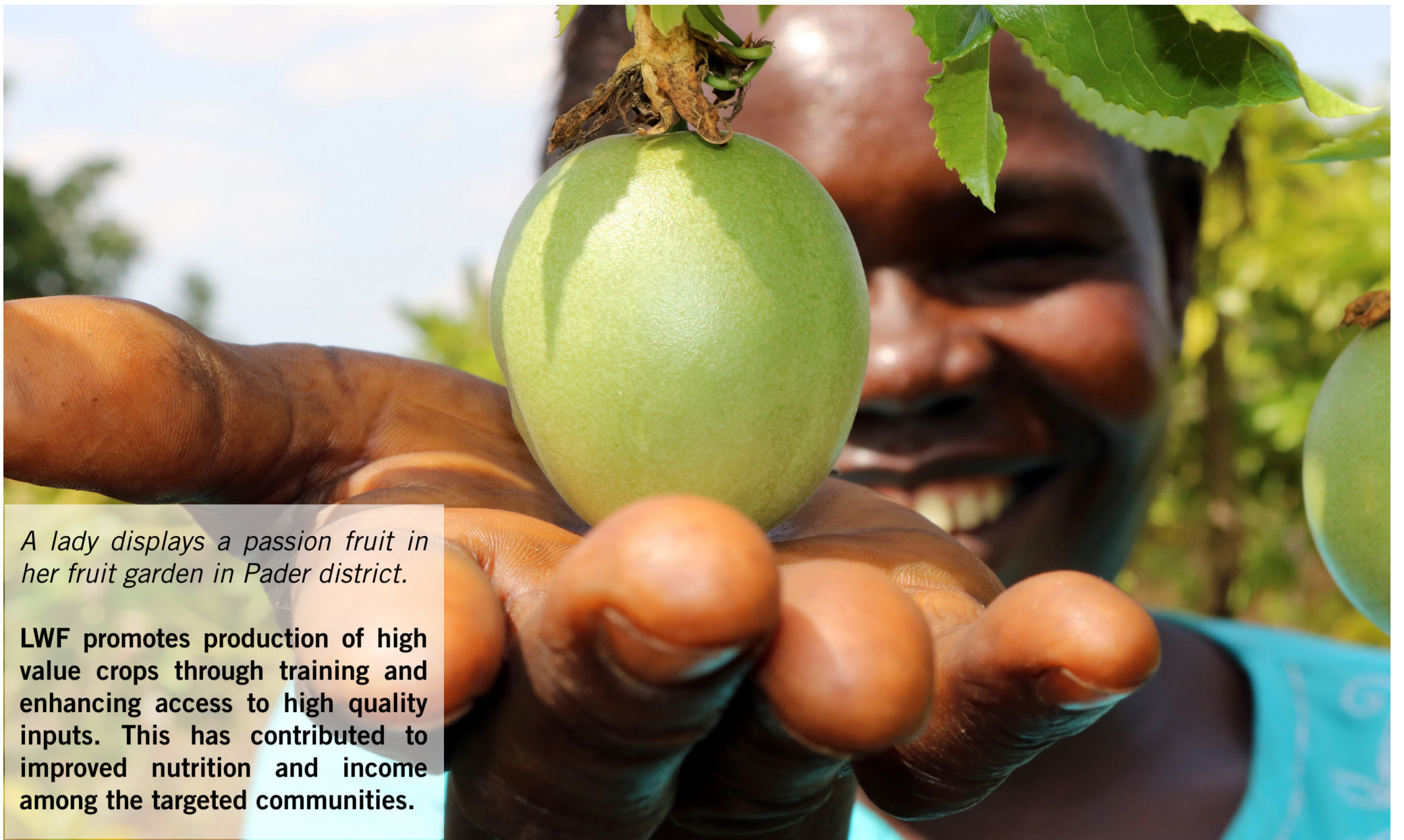
A lady displays a passion fruit in her fruit garden in Pader district. LWF promotes production of high value crops through training and enhancing access to high quality inputs. This has contributed to improved nutrition and income among the targeted communities.