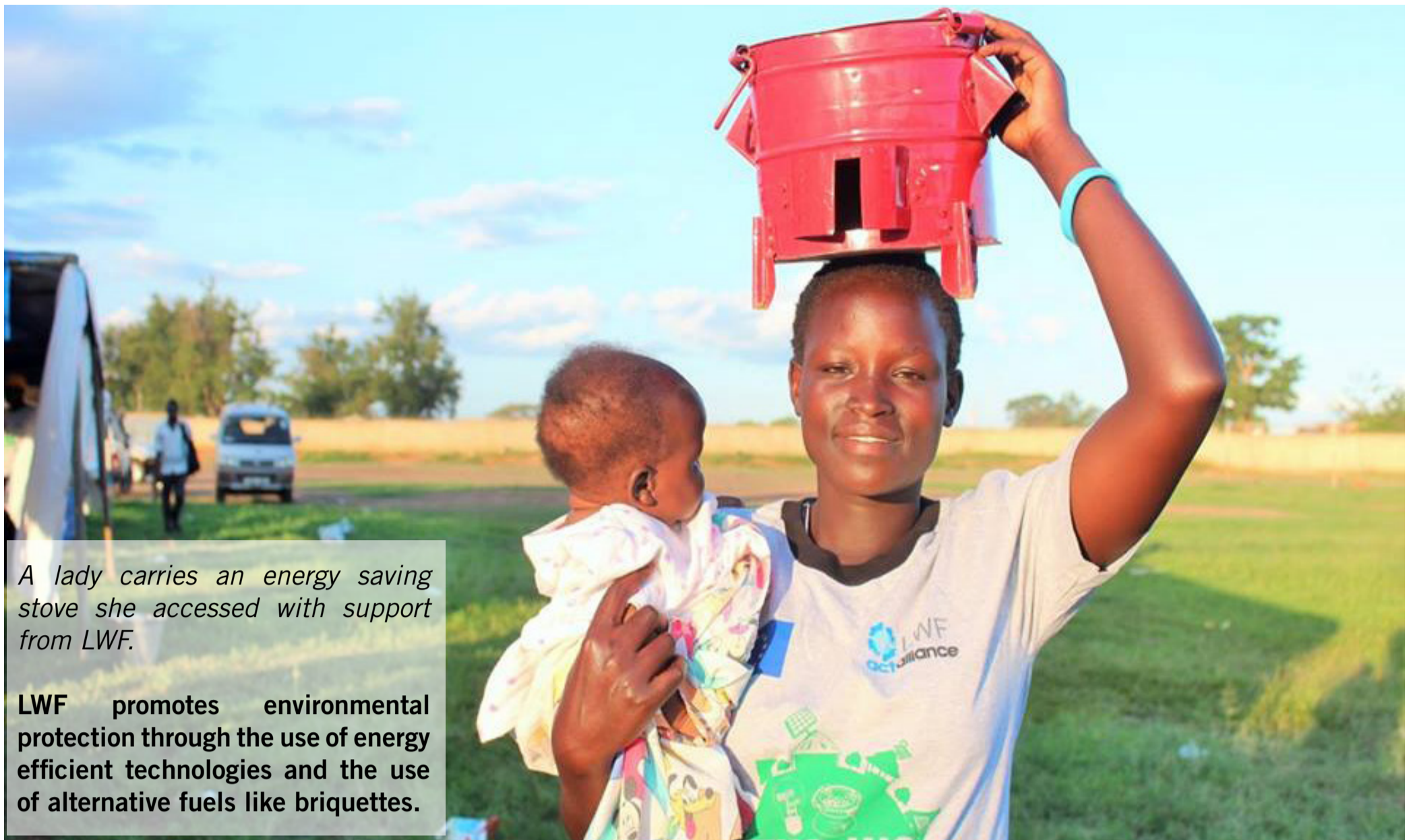
A lady carries an energy saving stove she accessed with support from LWF.

LWF promotes environmental protection through the use of energy efficient technologies and the use of alternative fuels like briquettes.