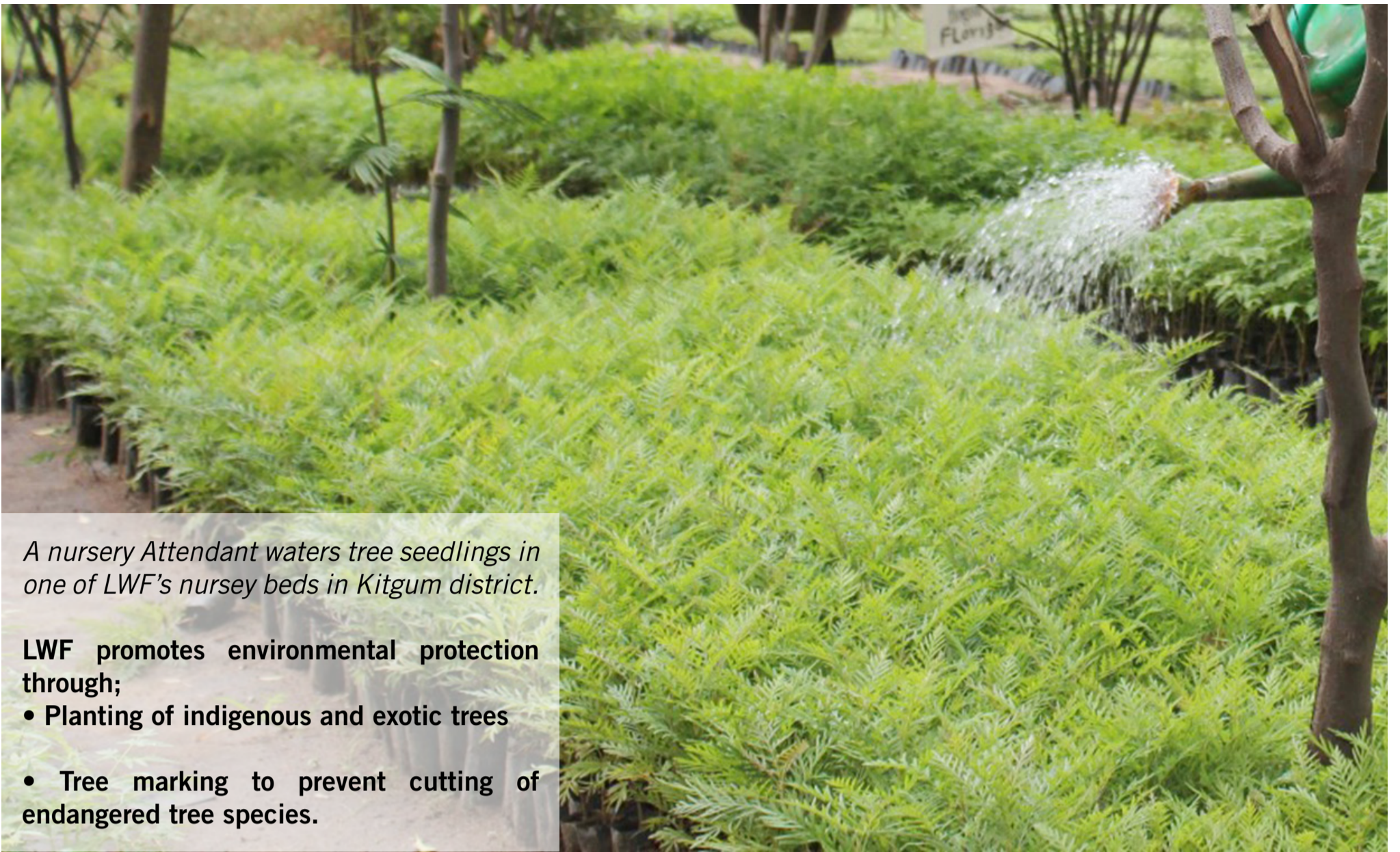
A nursery Attendant waters tree seedlings in one of LWF's nursey beds in Kitgum district.

LWF promotes environmental protection through;