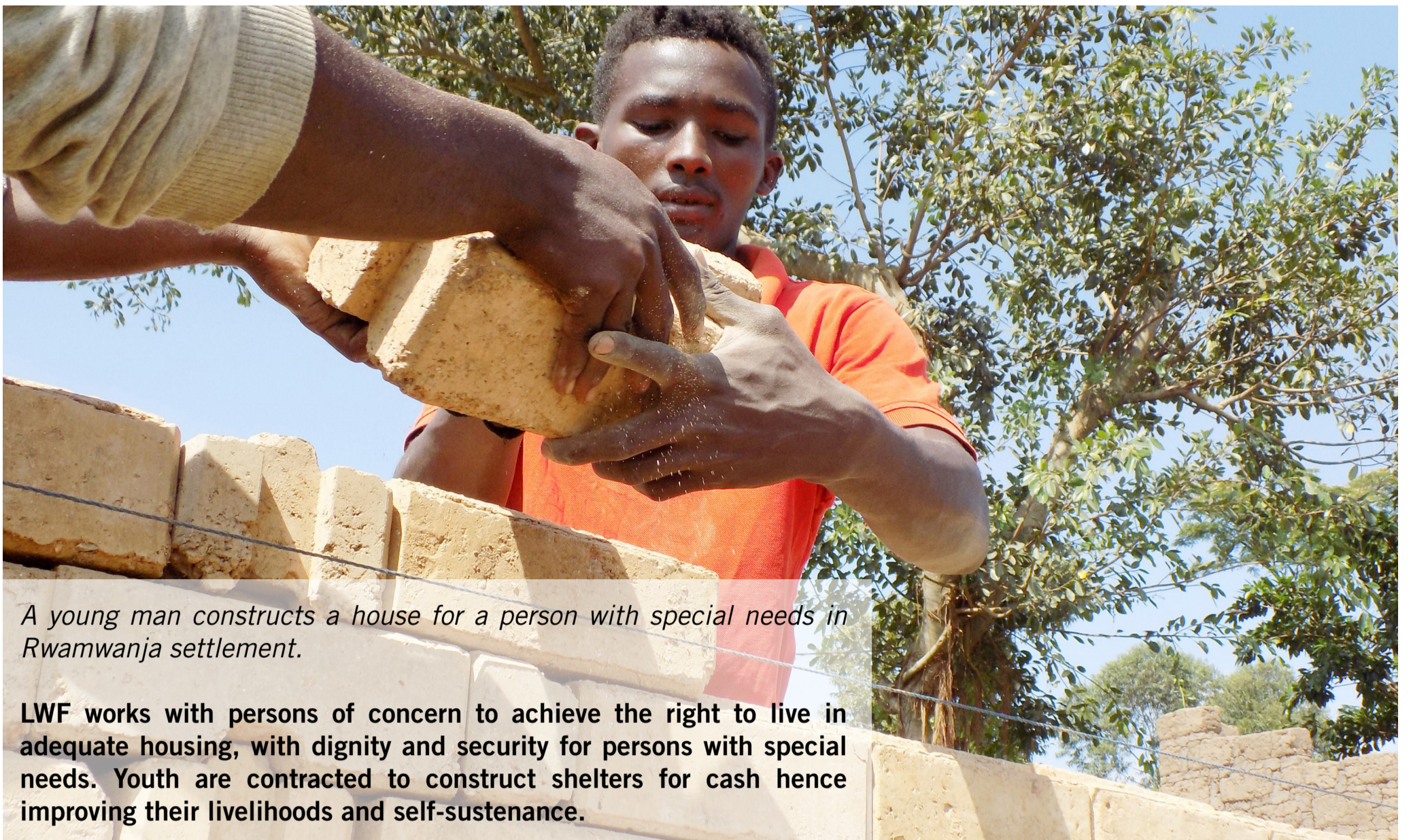
A young man constructs a house for a person with special needs in Rwamwanja settlement.

LWF works with persons of concern to achieve the right to live in adequate housing, with dignity and security for persons with special needs. Youth are contracted to construct shelters for cash hence improving their livelihoods and self-sustenance.