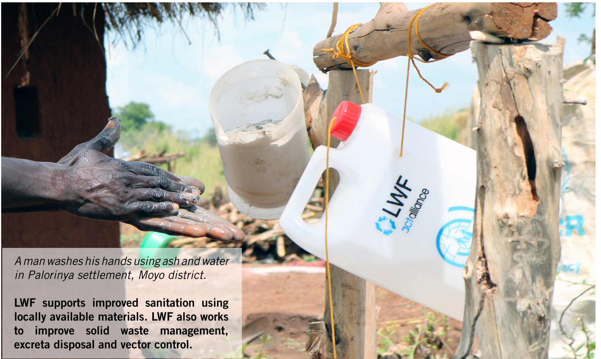
A man washes his hands using ash and water in Palorinya settlement, Moyo district.

LWF supports improved sanitation using locally available materials. LWF also works to improve solid waste management, excreta disposal and vector control.