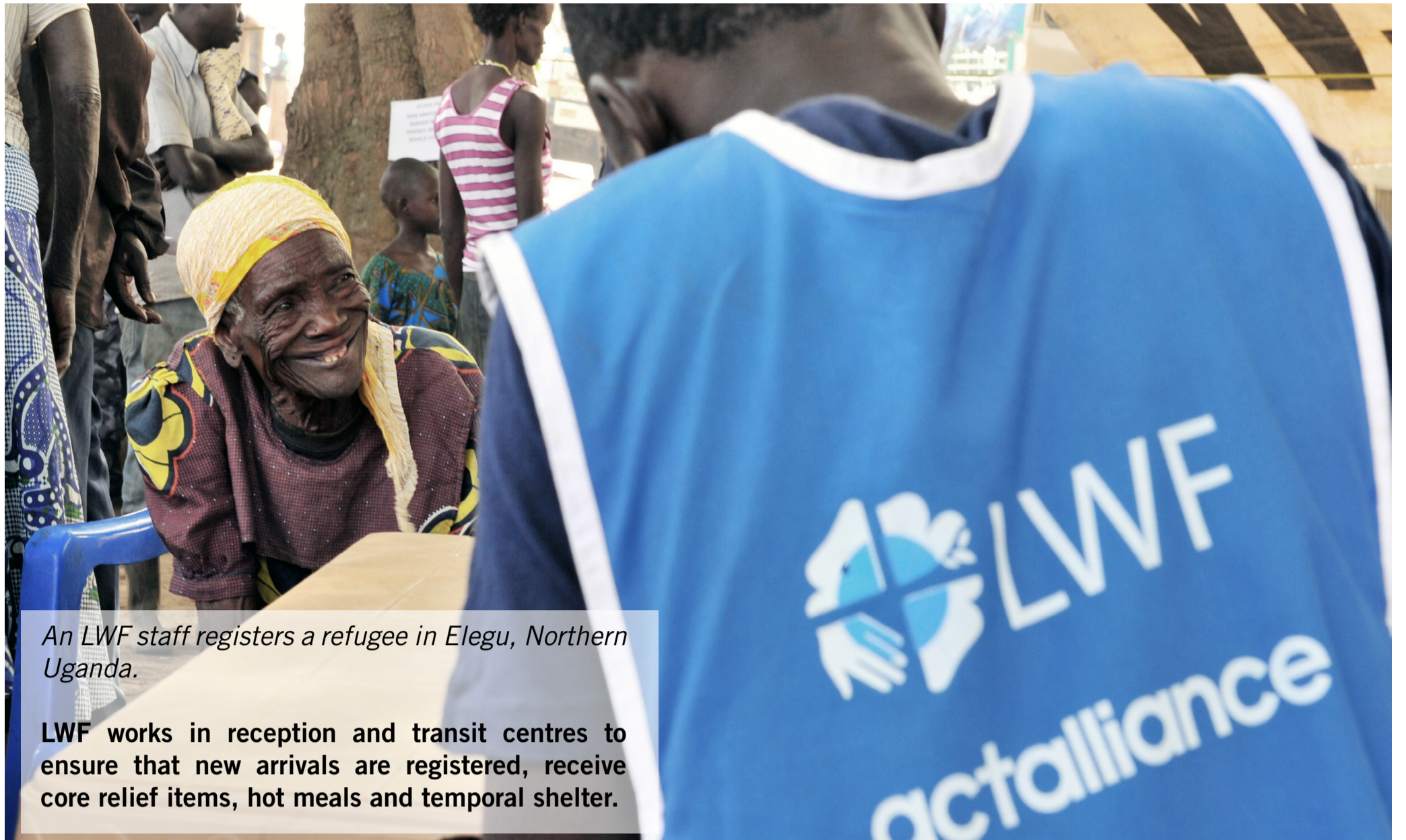
An LWF staff registers a refugee in Elegu, Northern Uganda.

LWF works in reception and transit centres to ensure that new arrivals are registered, receive core relief items, hot meals and temporal shelter.