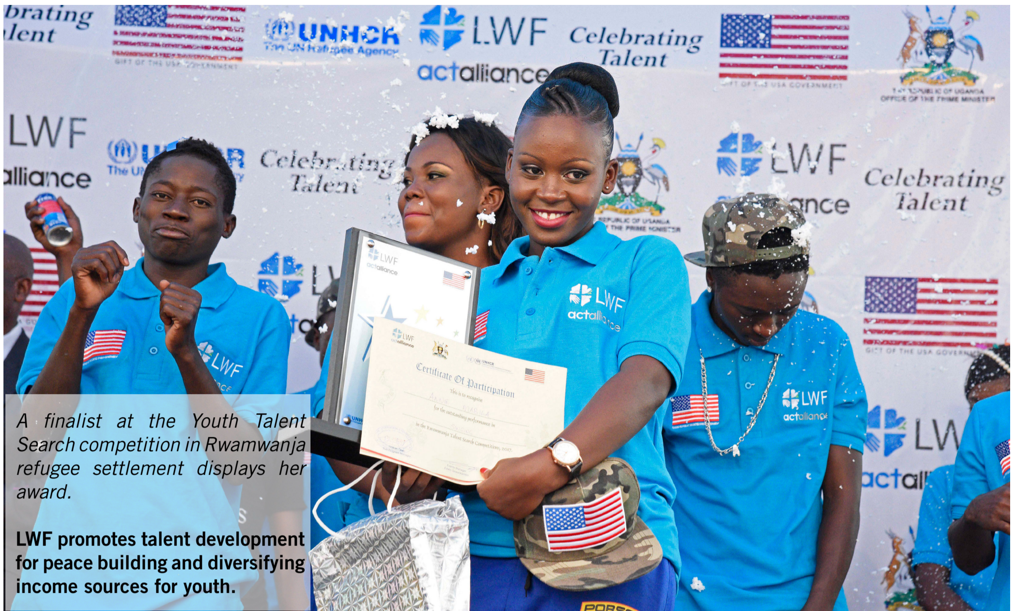
A finalist at the Youth Talent Search competition in Rwamwanja refugee settlement displays her award.

LWF promotes talent development for peace building and diversifying income sources for youth.