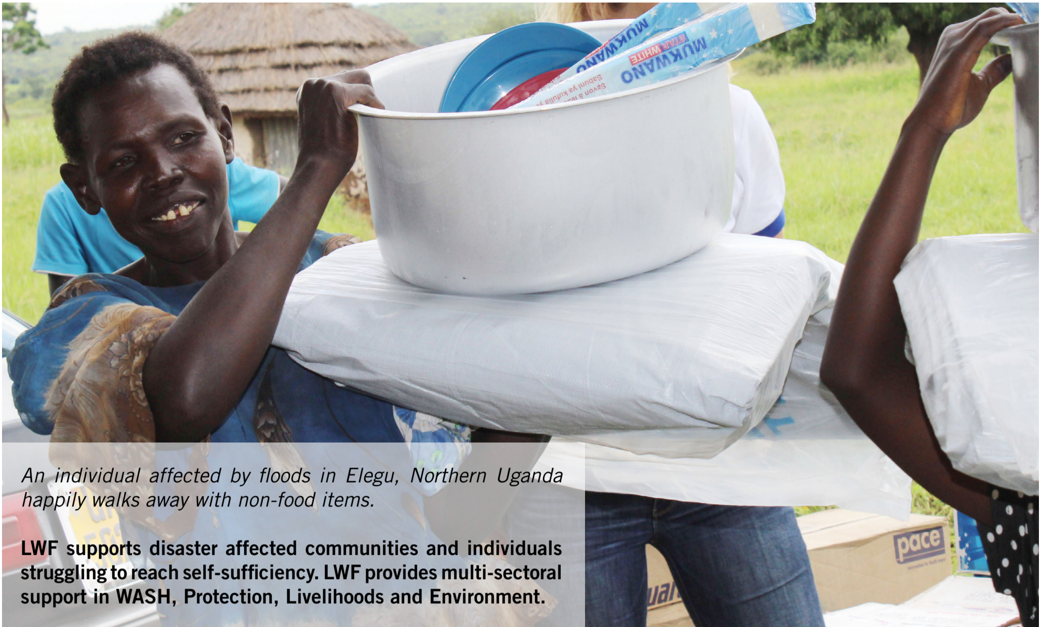
An individual affected by floods in Elegu, Northern Uganda happily walks away with non-food items.

LWF supports disaster affected communities and individuals struggling to reach self-sufficiency. LWF provides multi-sectoral support in WASH, Protection, Livelihoods and Environment.