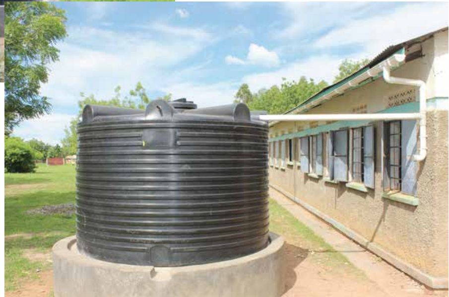
A Water harvesting tank at St Luke Primary School