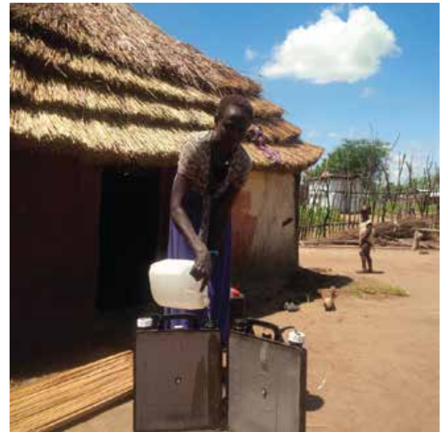
One of the beneficiaries demonstrating how to use the Solvatten.