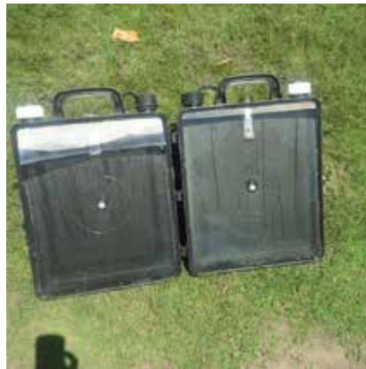
The solvatten is placed under direct sun to heat up the water