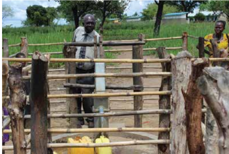
The Head Teacher of Okawa primary school demonstrates how the borehole constructed at their school works.