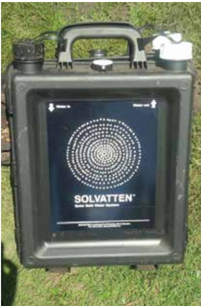
The solvatten water container

Solvatten is an innovative and environmentally-friendly technology that makes un-safe water drinkable through using heat and Ultraviolet radiation from the sun. The Solvatten consists of two hinged containers each holding 20 liters of water. It has fine mesh filters which reduce the turbidity of the water and convention currencies are created within the containers which make the process more efficient. The system has in-built filters that help in removing the larger organisms and physical particles. When done filling the Solvatten with water, it's put out with the glass part facing the sun. Within 2-6 hours of being in sun, the red sad face turns into a green smiling face a sign to show that the water is safe for use.