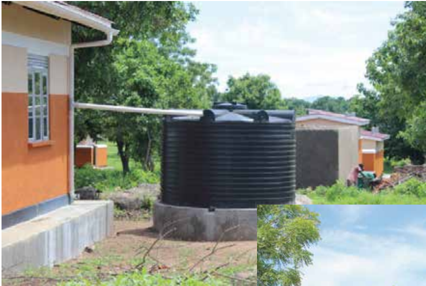
A Water harvesting tank at Pekele Girls School