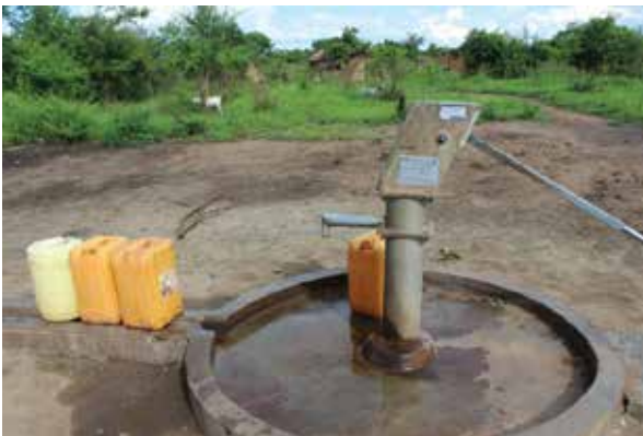
A borehole at Pagirinya primary school