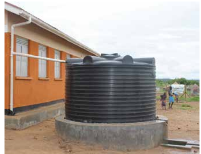
A newly constructed Water harvesting tank at Nyumanzi Primary School