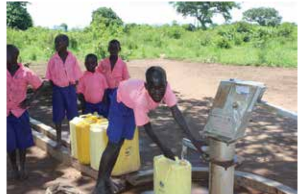
Pupils of Paruga primary school collecting water from a borehole constructed at their school.