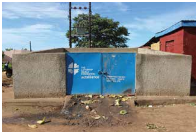
Newly constructed collection point at Awindiri Market