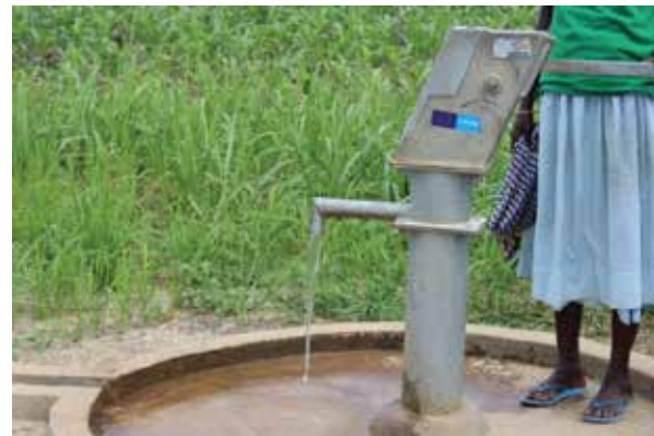
Borehole drilled at Lewa Secondary school